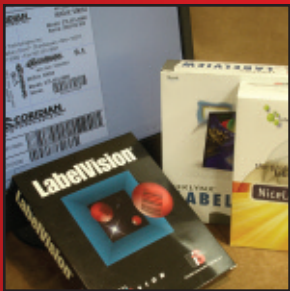
Software & Integration