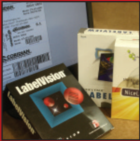
Software & Integration