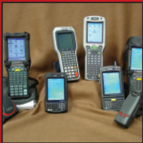
Data Collection Solutions