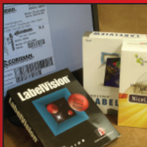
Software & Integration